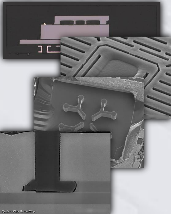
TABLE OF CONTENTS (~120 pages)